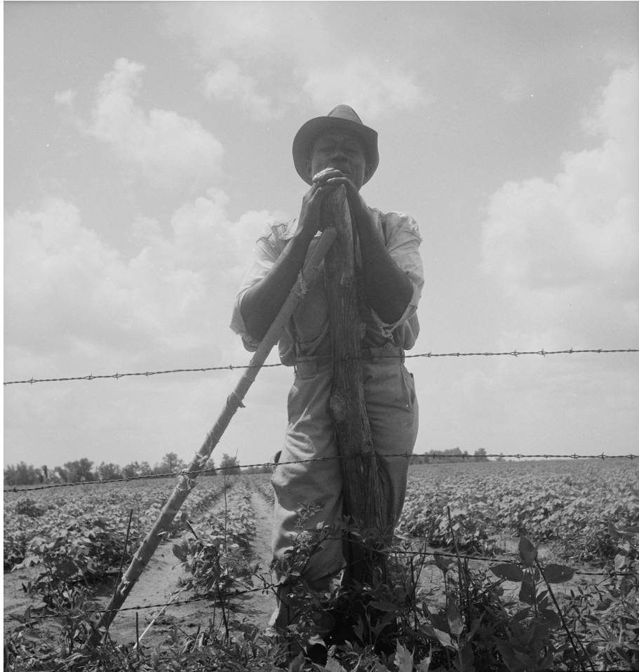
Photo: Negro sharecropper with twenty acres. Library of Congress, Prints & Photographs Division, FSA/OWI Collection, [LC-DIG-fsa-8b32339]; by Dorothea Lange, June 1938